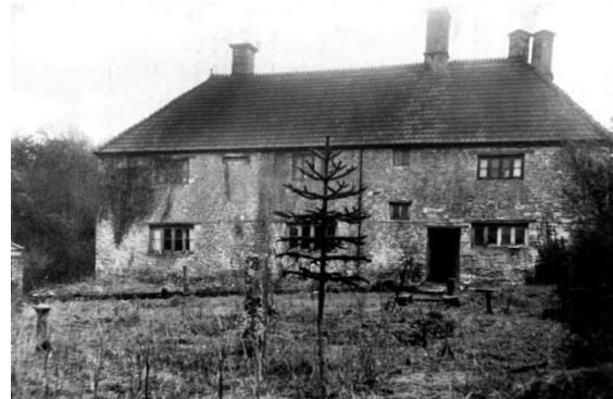
Callas House in 1960 just before demolition