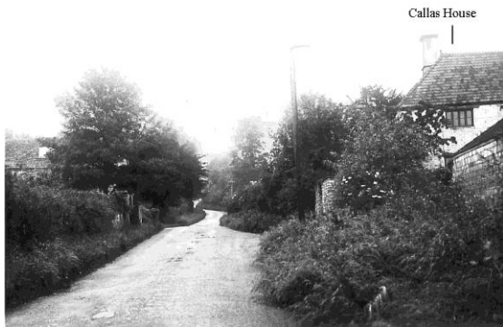
Looking up Callas Hill